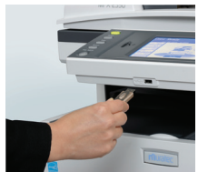
USB Host Drive (print from / scan to)