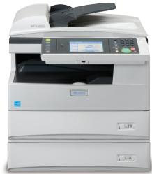
MFX-2570 w/Optional 500-Sheet Cassette